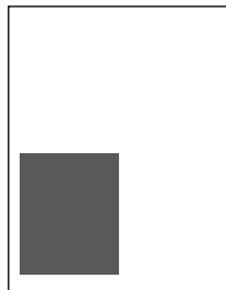
Quarter Page 132mm high x 93mm wide