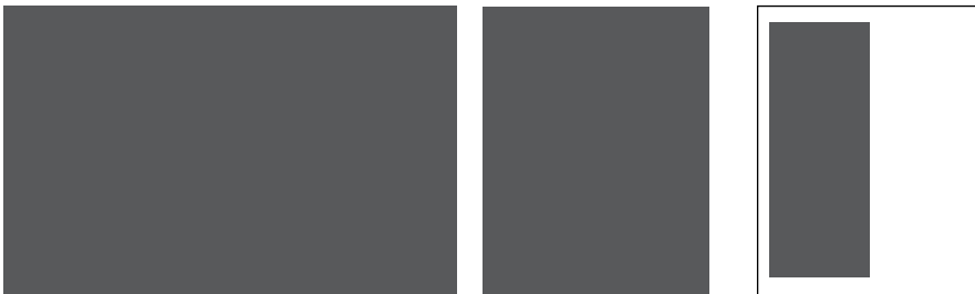
Double Page Spread - with bleed Bleed Size: 303mm high x 426mm wide