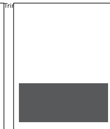
Third Page Horizontal 88mm high x 190mm wide